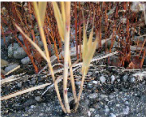
Tan/beige new growth