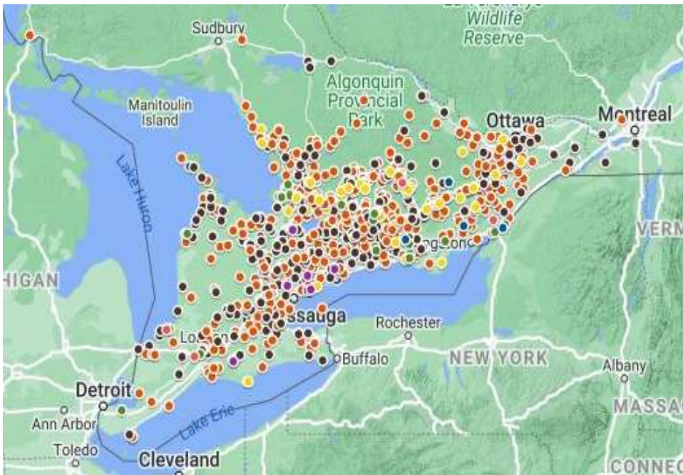
Left: Map showing our 2021 hospital admissions and where they came from.

Seven of our eight species of turtles are considered Endangered, Threatened, or Species of Special Concern. Every turtle counts!