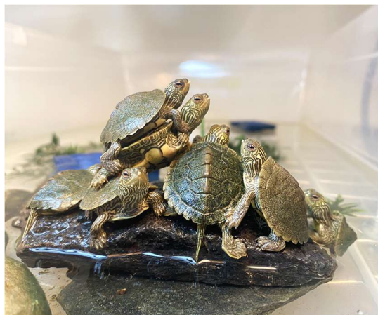
Above: These map turtles are one clutch of hundreds hatched at the Centre. All will be returned to their mothers' wetlands.