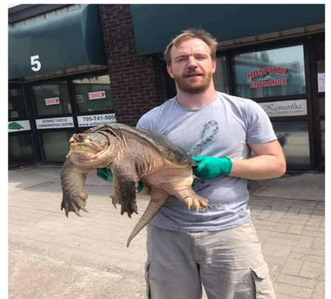
Above: Just a few of the thousands of turtles released each year! Far left: A clutch of hatchlings is carefully released. Middle: A painted turtle is happy to get back home. Far right: A very large snapping turtle prepares to be taxied home!

OTCC admission numbers have risen astronomically over recent years, from only 140 in 2010 (and 102 hatchlings) to already over 1600 in 2022, with thousands of hatchlings expected. This is because there is an increased awareness among the public, which means that more turtles are getting the help they need.