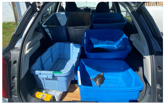
Above: Two car loads of turtles ready to go home! Our volunteers and staff work tirelessly to make sure that every turtle gets home safely. We scout out the location where the turtle was found, then choose the nearest appropriate body of water for the life stage.