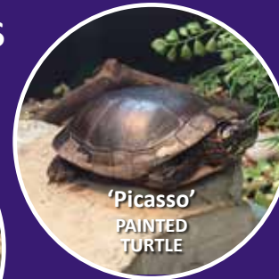
'Picasso' PAINTED TURTLE