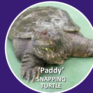
'Paddy' SNAPPING TURTLE