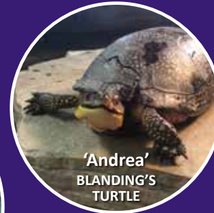
'Andrea' BLANDING'S TURTLE