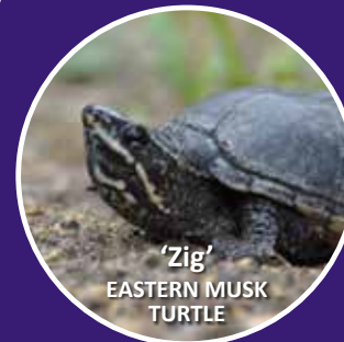
'Zig' EASTERN MUSK TURTLE

For more information or to book an event, email us at education@ontarioturtle.ca