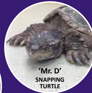
'Mr. D' SNAPPING TURTLE