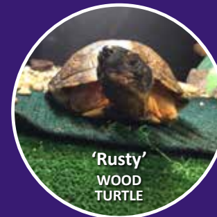
'Rusty' WOOD TURTLE