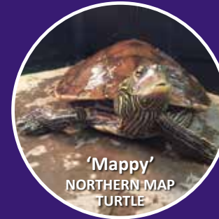
'Mappy' NORTHERN MAP TURTLE