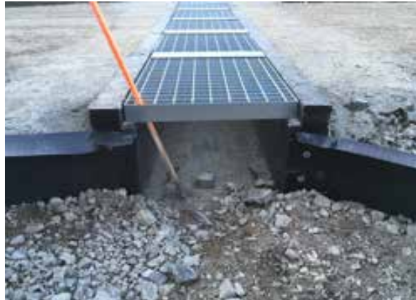
Many types of culverts can be utilized and often are constructed specifically as ecopassages.

Sometimes, an existing culvert can be utilized, and other times one has to be constructed. This can be costly, and is best carried out when roads are due to be serviced.