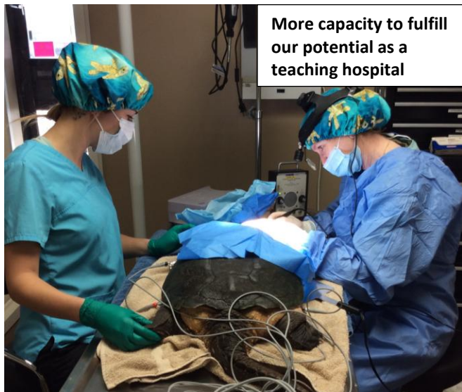
More capacity to fulfill our potential as a teaching hospital