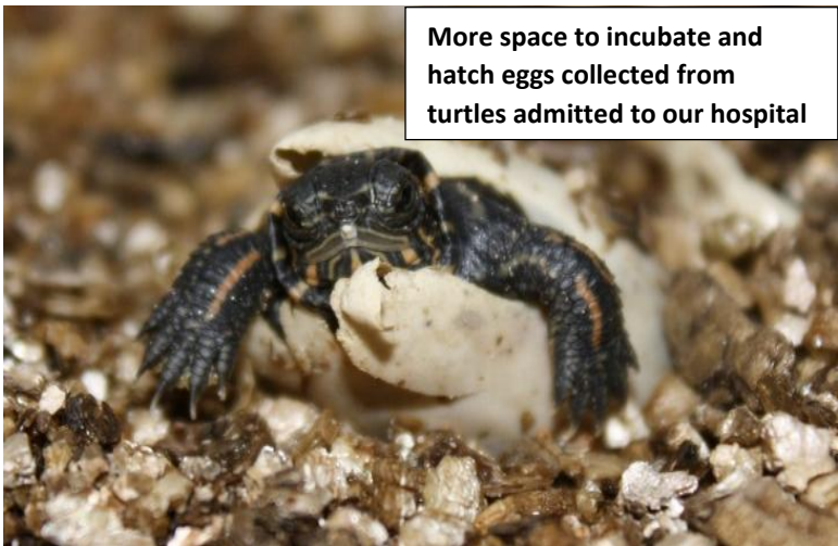
More space to incubate and hatch eggs collected from turtles admitted to our hospital