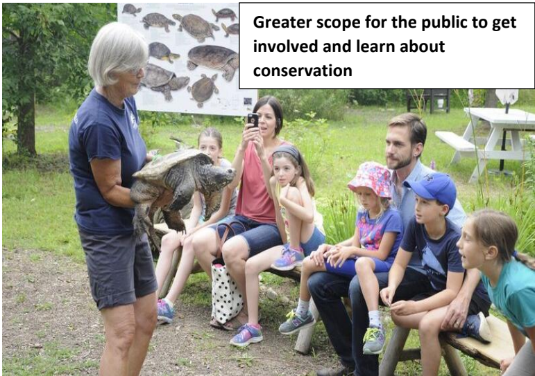
Greater scope for the public to get involved and learn about conservation

All necessary surveys and plans have been completed, and we aim to start construction next year!