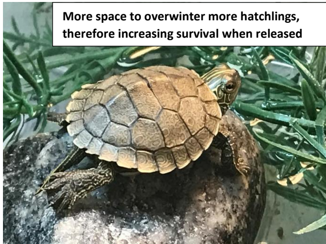
More space to overwinter more hatchlings, therefore increasing survival when released