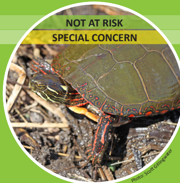
Midland Painted Turtle Chrysemys picta