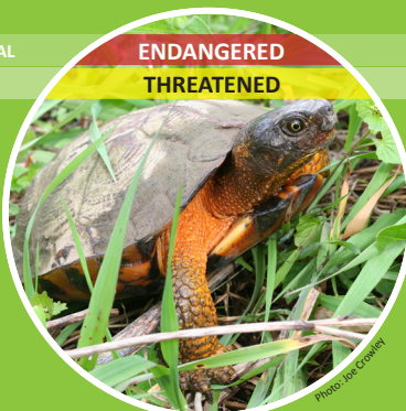
Wood Turtle Glyptemys insculpta