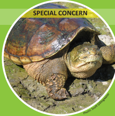
Snapping Turtle Chelydra serpentina