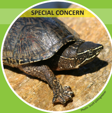
Eastern Musk Turtle (Stinkpot) Sternotherus odoratus