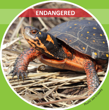
Spotted Turtle Clemmys guttata