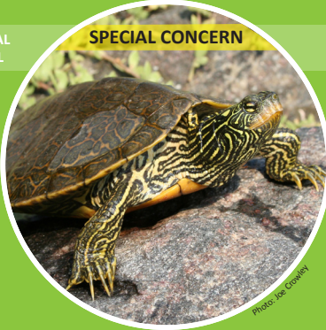
Northern Map Turtle Graptemys geographica