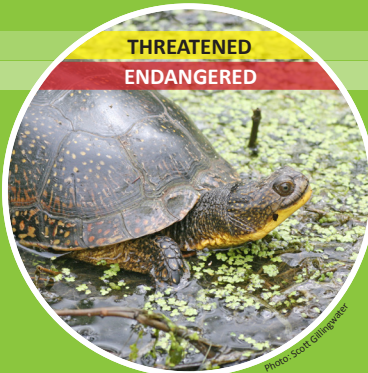
Blanding’s Turtle Emydoidea blandingii