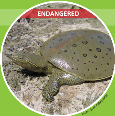
Spiny Softshell Turtle Apalone spinifera